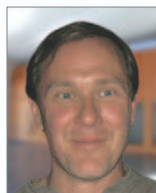
Gary Siuzdak (The Scripps Research Institute, USA)

Activity metabolomics enabled by XCMS & METLIN